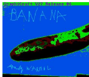
ANDY WARHOL (1928-1987) Untitled (Banana) Non-fungible token (NFT) 4500 x 6000 pixels (bytes) Executed circa 1985 and minted in 2021.