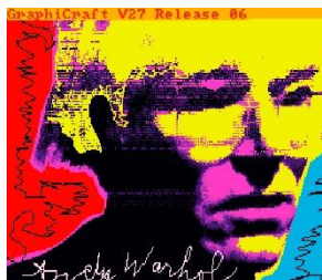
ANDY WARHOL (1928-1987) Untitled (Self-Portrait) Non-fungible token (NFT) 4500 x 6000 pixels (bytes) Executed circa 1985 and minted in 2021.

Created in a paint program on Warhol's Commodore Amiga personal computer in the mid-1980s, the group of five works includes two self-portraits, his signature flower and Campbell's soup can motifs and a rendering of a single banana on a blue background. Each of the digital drawings will be minted as NFTs in advance of the sale conclusion and transferred to the new owner's digital wallet upon completion of the sale.